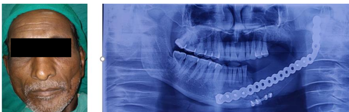
Figure 3: 1 year follow up photograph and OPG